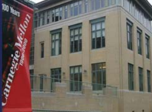
Carnegie Mellon University - Baker Hall Burt Hill Kosar Rittelmann Associates