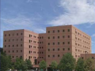
East Suburban Health Center Valentour English, Architects