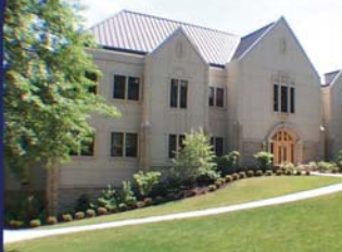
Geneva College - Academic Building WTW/Martin Chetlin Inc., Architects