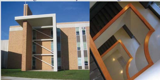
Architect - Burgess and Niple

Jendoco Construction Corporation was selected by West Virginia University to complete the $2 Million Dollar addition to the Main Classroom Building at their Parkersburg Campus.