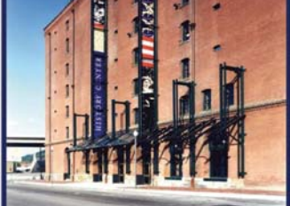
Senator John Heinz History Center Bohlin Cywinski Jackson, Architects