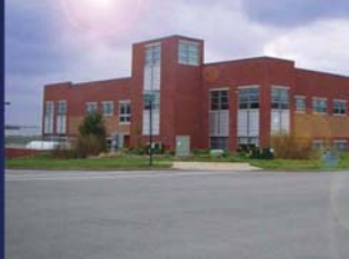
Penn State University Electro-Optics WTW Architects