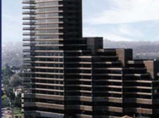
Trimont Condominiums L.D. Astorino Architecture