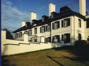
Center for the Arts The Design Alliance, Architects