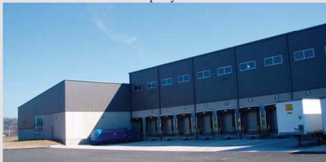
Architect - Desmone and Associates

Jendoco Construction Corporation recently completed the 87,000 square foot expansion and renovation to the American Textile Company at RIDC Riverplace in Duquesne, Pennsylvania. Jendoco provided pre-construction services from schematics through construction documents, yielding a GMP (Guaranteed Maximum Price) that was within the owners' original budget.