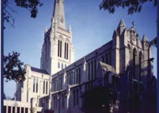
Calvary Episcopal Church Allen, Harbison & Associates, Architects