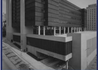
University of Pittsburgh - School of Nursing Deeter Ritchey Sippel, Architects