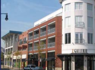
SouthSide Works - The Flats Design 3 Architecture Inc.