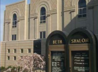
Beth Shalom Synagogue Indovina Associates, Architects