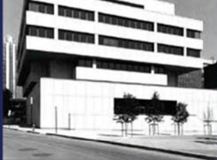
University of Pittsburgh - School of Law Johnstone Newcoher & Valentour, Architects