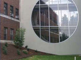
Center for Pauline Auberle Foundation Damianos & Anthony, Architects