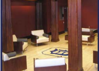
Duquesne University - A.J. Palumbo DRS Architects